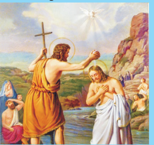
Thur. 13<sup>th</sup> January 2022 St Hilary (optional memorial)

Sunday 9<sup>th</sup> Jan. 2022 The Baptism of the Lord