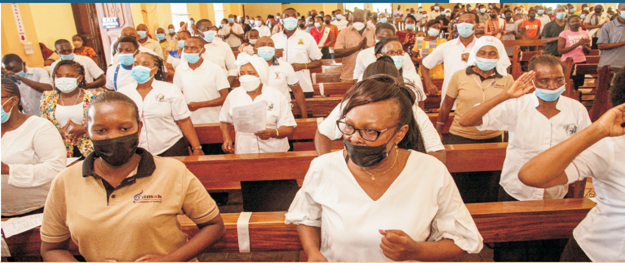
A section of HGC choir members singing their hearts out during a recent Sunday mass

Mon. 6 th Dec. 2021 Or: St Nicholas (optional memorial) Is 35:1-10; Ps 85 Lk 5:17-26.