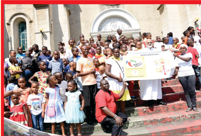
The banner of the Pontifical Missionary Children being displayed in front of the Cathedral with the theme " Baptized and sent"