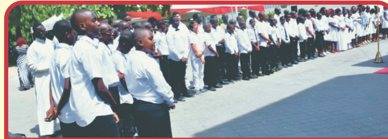
The candidates for Confirmation line up before the Archbishop