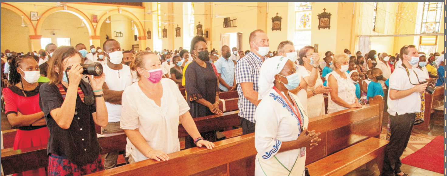
Visitors & Priests from Poland joined our parishioners for the 11am mass during the Solemnity of Our Lord at Holy Ghost Cathedral.