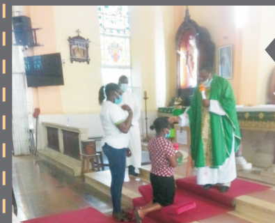
Ms. Perpetua being officially received in the Catholic Church just a day before her wedding.

We are inviting all married couples, religious men and women to a Marriage Encounter Original Weekend at Diani Forest Lodge- Ukunda from 3rd December to 5th December 2021, check in time 6:00pm. Charges will be Ksh 7,000 per couple, priest & Religious Ksh 3,500. For more information, contact 0722686249