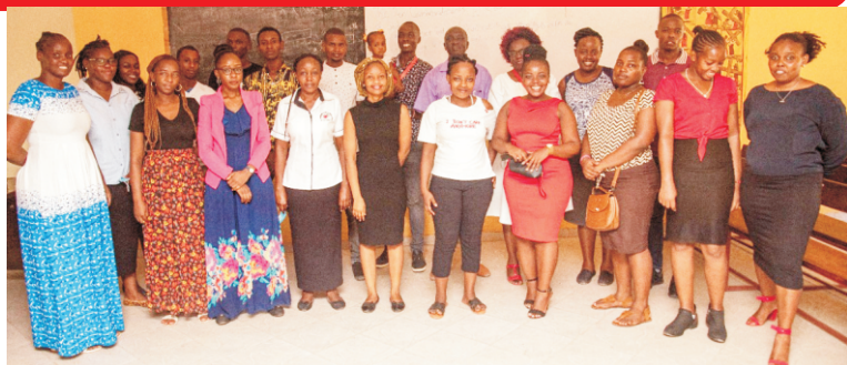
Liturgy ministry meeting with the YCA & senior Youth in a very productive session .

Importantly, prayer provides us the spiritual energy, courage and confidence to stand firm. Therefore, as a family, this Advent offers us the opportunity to unite in prayers as we wait for the Lord. So, rather than engage ourselves only with mundane preparations, let us engage ourselves in intensive prayers. We must prepare together as a family through prayer. May our Lord find us awake and ready when he comes in glory. So, with the psalmist let us proclaim: “To you, O Lord I lift up my soul.”