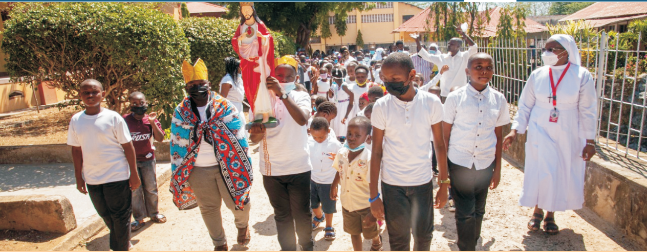
Children's procession around the church compound to celebrate the Feast of Christ the King last Sunday after their 9:00 o'clock mass.