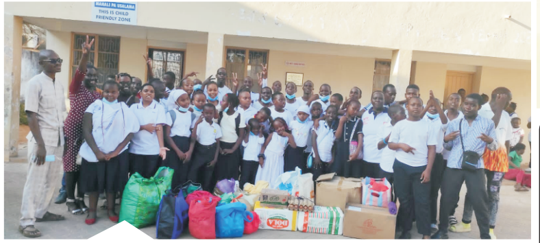
Act of mercy by alter servers