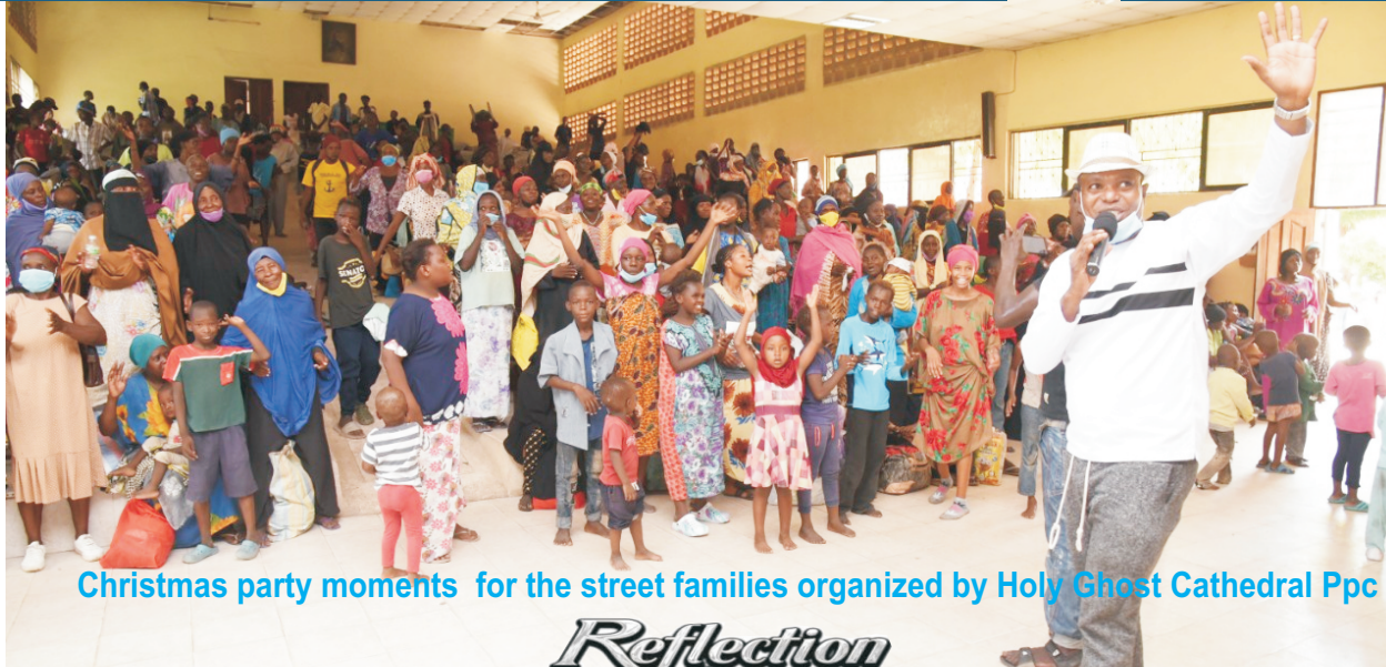
Christmas party moments for the street families organized by Holy Ghost Cathedral Ppc

THE HOLY FAMILY OF JESUS, MARY AND JOSEPH